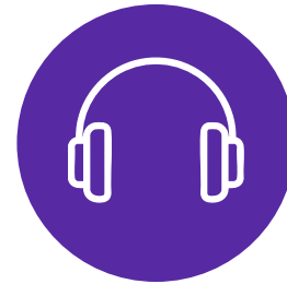
Noise cancelling headphones